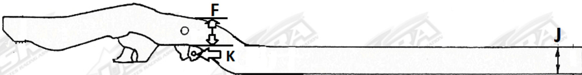
1968 - 1972 GM Chevelle Frame

= 2.00 - 2.25 Inches from center of bolt hole to bottom of frame.